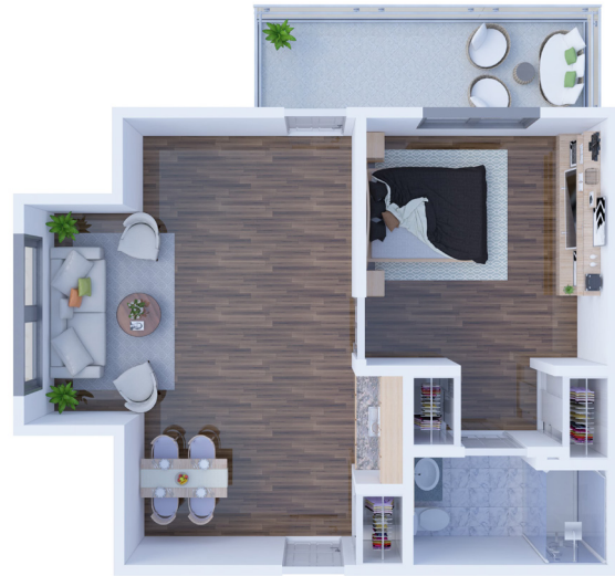
B8 One Bedroom 665 SQ FT