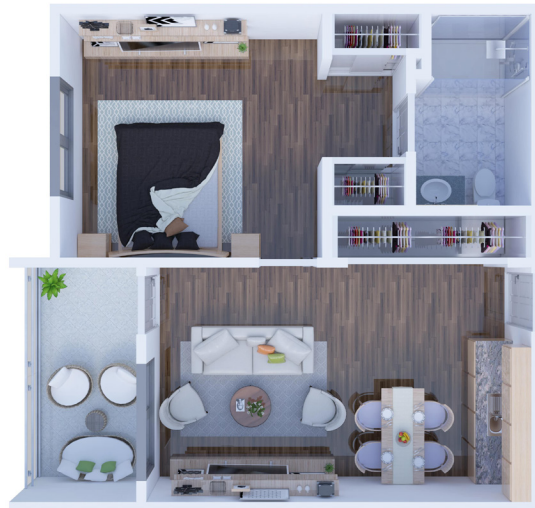
B1 One Bedroom 549 SQ FT

Solstice Senior Living at Bangor 922 Ohio St., Bangor, ME 04401 (877) 391-4801 SolsticeSeniorLivingBangor.com