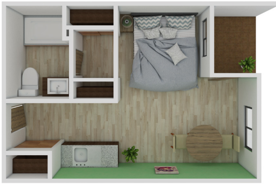
A1 Studio 396 SQ FT

Solstice Senior Living at Bangor offers several floor plan choices to suit your needs.