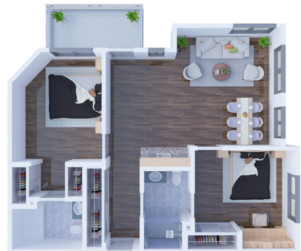
C5 Two Bedroom 975 SQ FT