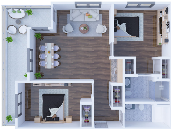
C2 Two Bedroom 937 SQ FT