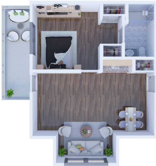
B5 One Bedroom 542 SQ FT