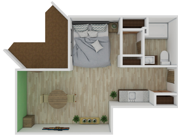
A4 Studio 563 SQ FT