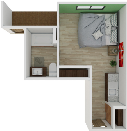
A6 Studio 335 SQ FT